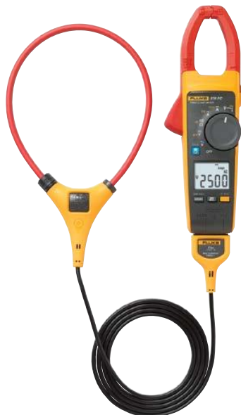
Fluke 376 FC with iFlex™