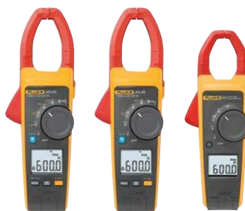
Fluke 375 FC