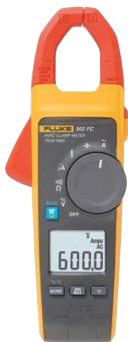
Fluke 902 FC