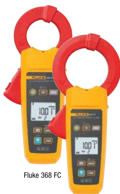
Fluke 368 FC