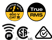
Fluke 369 FC