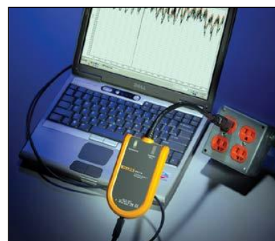
Includes PowerLog software

Actual transient display (> 100 \mu s) with time stamp – Quickly identify issues with included graphical software.