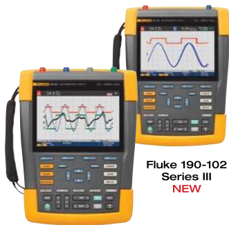
Fluke 190-204 Series III NEW

Fluke ScopeMeter 190 Series III Portable Oscilloscopes are high-performance scopes built for harsh industrial environments. These high-performance portable oscilloscopes come with 2 or 4 independently insulated input channels, an IP51 dust and drip proof rating and a CAT III 1000 V/CAT IV 600 V safety rating. Choose from 500 MHz, 200 MHz, 100 MHz or 60 MHz bandwidth models. Now plant maintenance engineers can take a 2- or 4-channel scope into the harsh world of industrial electronics.