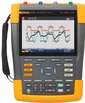
Fluke 190-504 Series III NEW